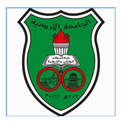
Tender No: 10 / 2018

Tender for Supervision of Design, Engineering, Supply, Delivery, Installation, Testing, Commissioning, Cleaning and Maintenance of Grid-Connected16MW AC Photovoltaic Systems at the University of Jordan